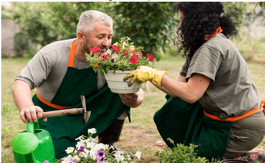
Imagem 2: Casal plantando flores

In a few weeks the flowers will grow taller. When they are about eight inches tall, Mrs. Mott will cut them and put them in a vase. She will put the vase of flowers on her kitchen table.