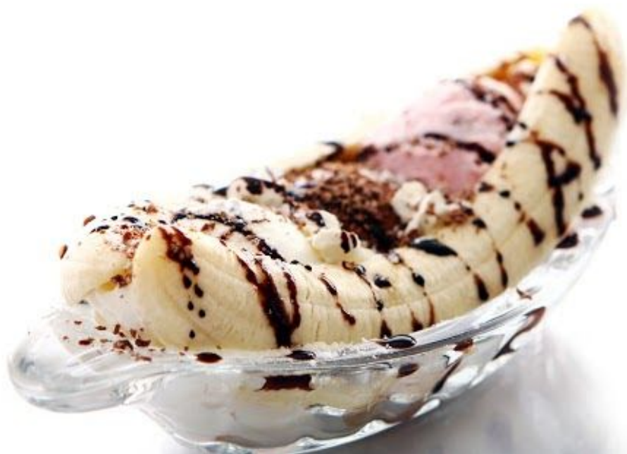
Imagem 4: Taça de sobremesa banana split

Banana splits taste delicious, and they are fast and easy to make. First, put a scoop of vanilla ice cream, a scoop of chocolate ice cream, and a scoop of strawberry ice cream in an oval bowl. Then, pour strawberry, butterscotch, and pineapple syrup over the scoops of ice cream. Next, top each scoop of ice cream with whipped cream, chopped nuts, and a cherry. Finally, peel a ripe banana and cut it in half lengthwise. Put the banana halves on opposite sides of the bowl. Be sure to have plenty of napkins because banana splits are messy to eat.